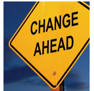
Weekly Evangelist (1)