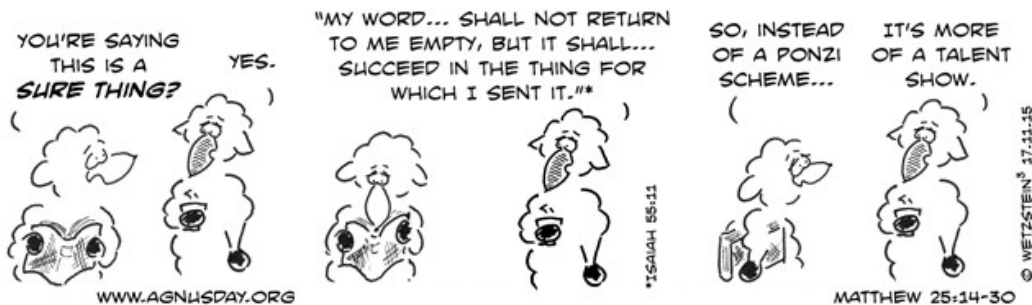
Weekly Evangelist (4)