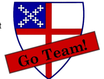
Weekly Evangelist (1)