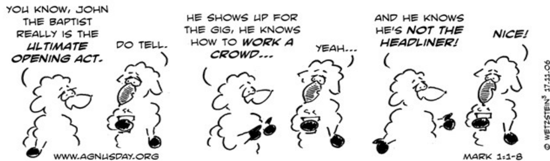
Weekly Evangelist (4)